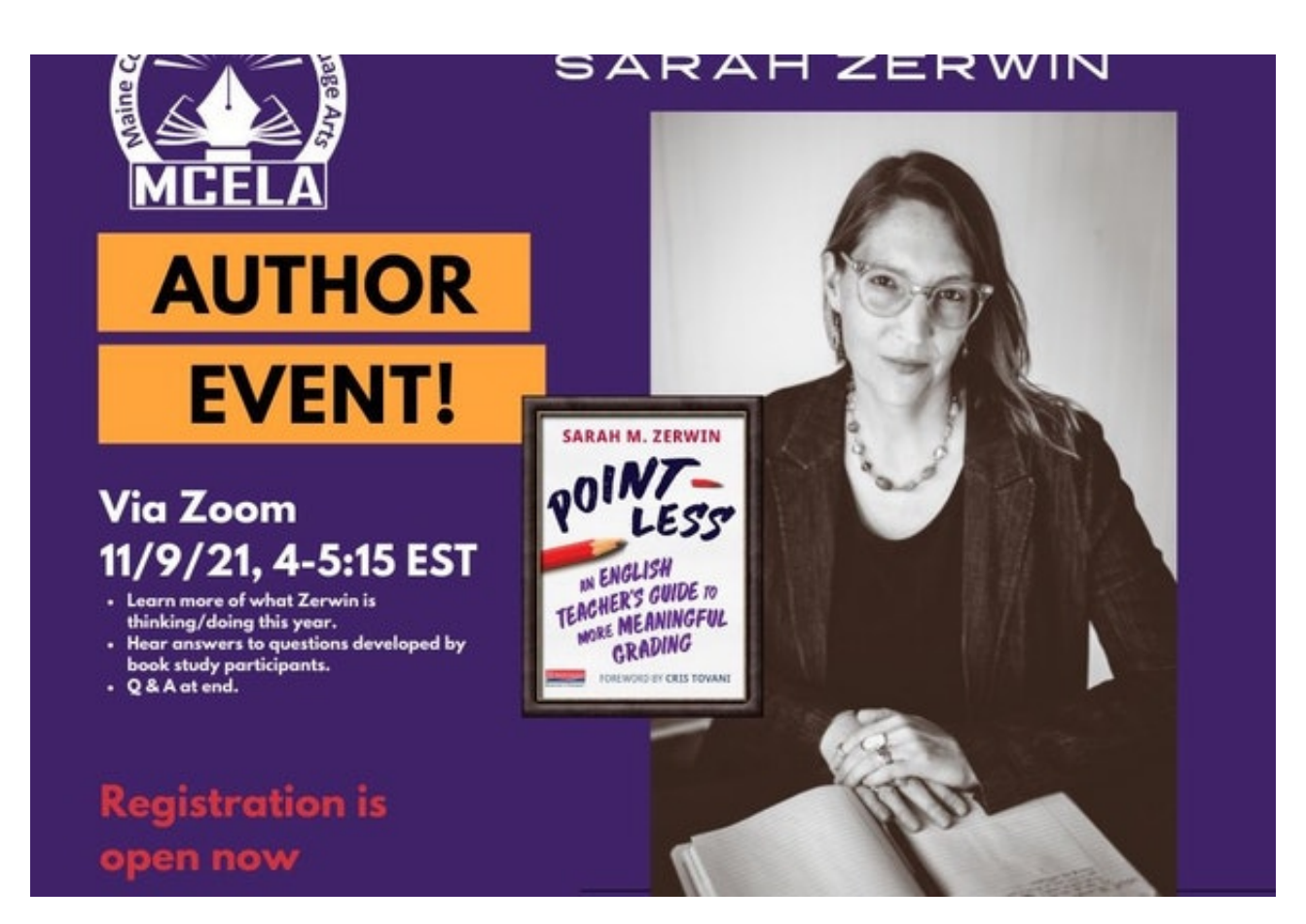
November 9 - Register Here