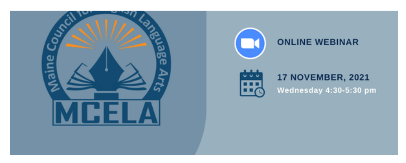
November 17 - Register Here