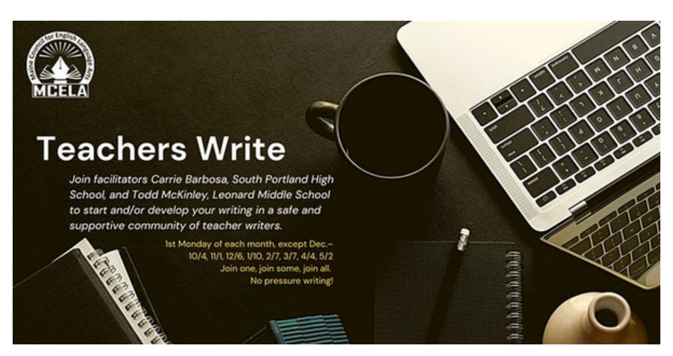
November 1 - Register Here