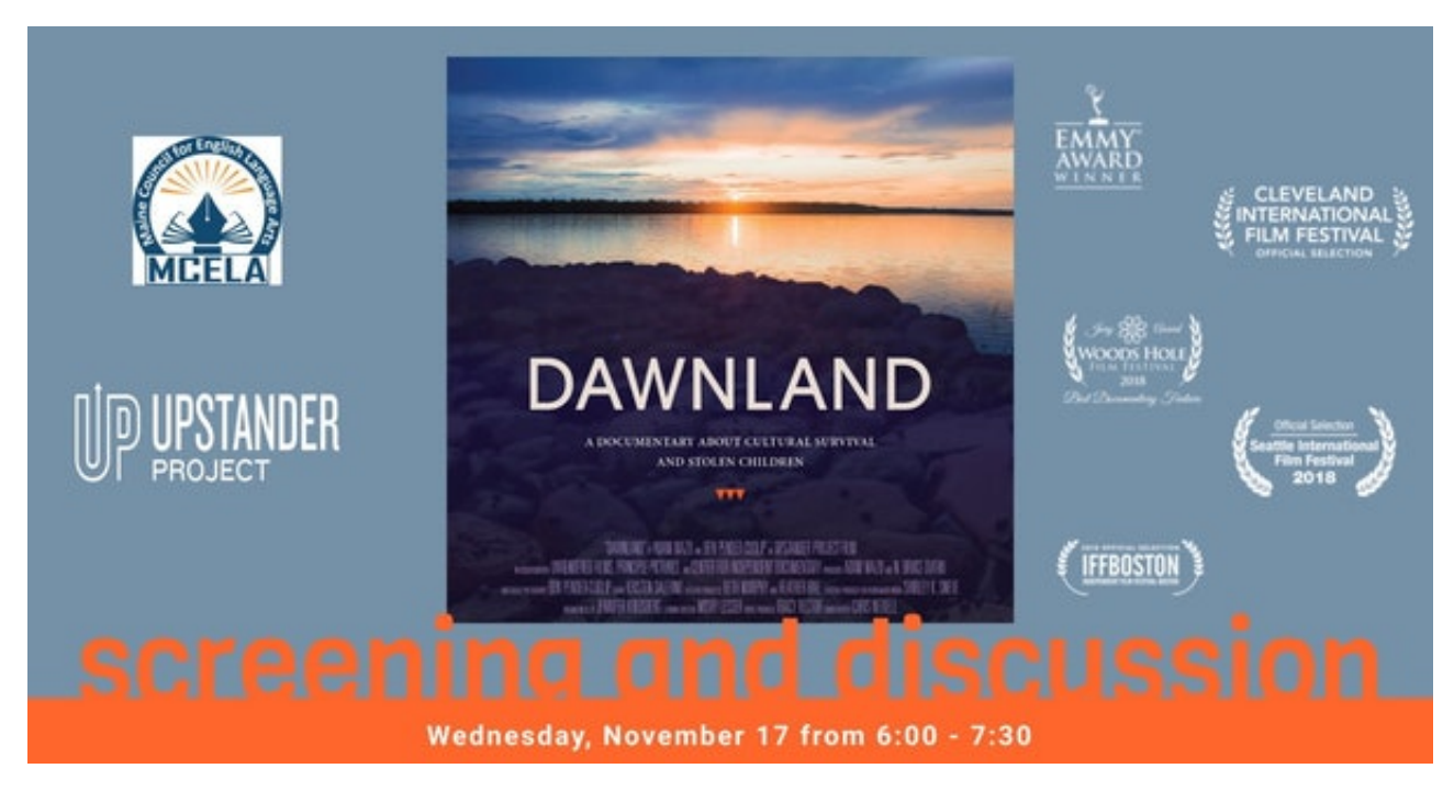
November 17 - Register Here

The DAWNLAND Screening/Discussion is FREE for all ELA educators!